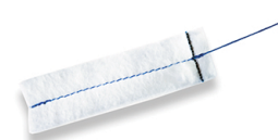
Americot® Neuro Pattie