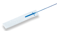
Delicot® Neuro Pattie