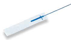
Delicot® Neuro Pattie