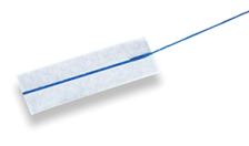
Ray-Cot® Neuro Pattie